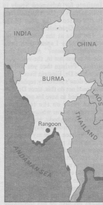
BURMESE FAMILY-The Southeast Asian nation of Burma is home to 35 Church members and 63 children. [Map by Ronald